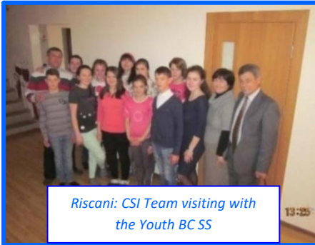
Riscani: CSI Team visiting with the Youth BCSS