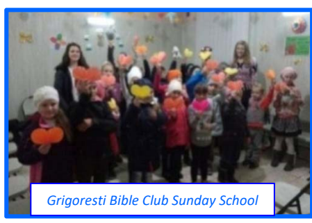
Grigoresti Bible Club Sunday School