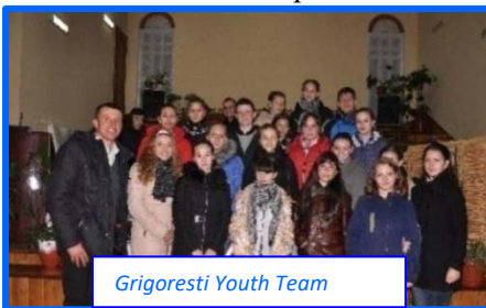
Grigoresti Youth Team

Teams of Youth volunteers who participate in their own Youth Bible Clubs also take on leadership roles in the Children's Bible Clubs. They have studied CSI strategy and materials which help them realize the Bible truths for youth and how to get involved in ministry. They enjoy teaching, leading games and activities, singing and leading prayers. The pastors of these churches appreciate very much the efforts of CSI and its strategy which helps bring children into church and create future leaders. What better foundation for a glorious church than a flourishing Sunday School? That he might present it to himself a glorious church, not having spot, or wrinkle, or any such thing... Eph. 5:27