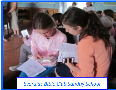
Sverdiac Bible Club Sunday School