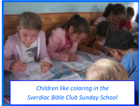
Children like coloring in the Sverdiac Bible Club Sunday School