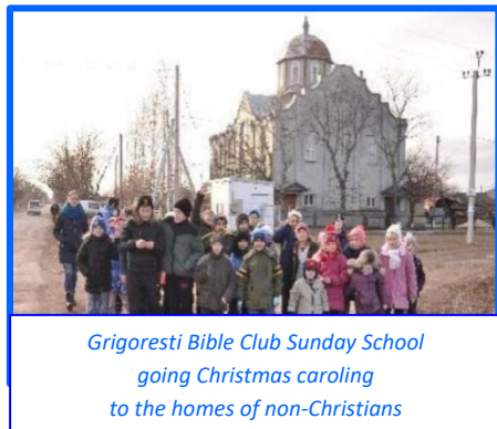
Grigoresti Bible Club Sunday School going Christmas caroling to the homes of non-Christians

There are 8 towns with Baptist Churches in which this happened in 2017: Sverdiac, Riscani, Chepariya (zone 6), Reutsel, St. Falesti, Catranic, (zone 4), Grigoresti, and Ciuciueni (zone 12). In all, these 8 Bible Clubs brought into the Sunday Schools 158 children and 64 youth. See chart.