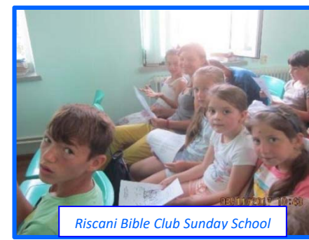
Riscani Bible Club Sunday School