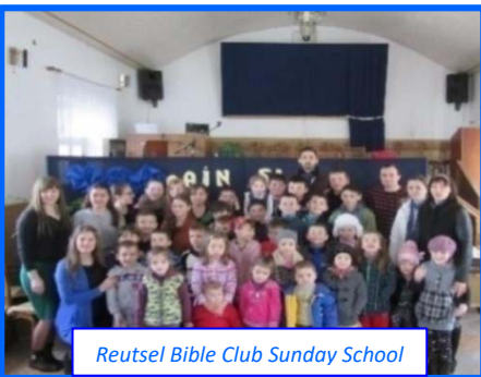
Reutsel Bible Club Sunday School