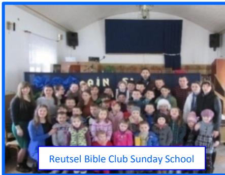
Reutsel Bible Club Sunday School