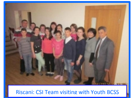
Riscani: CSI Team visiting with Youth BCSS

Teams of Youth volunteers who participate in their own Youth Bible Clubs also take on leadership roles in the Children's Bible Clubs. They have studied CSI strategy and materials which help them realize the Bible truths for youth and how to get involved in ministry. They enjoy teaching, leading games and activities, singing and leading prayers. The