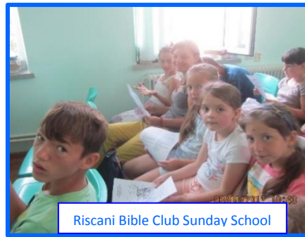
Riscani Bible Club Sunday School