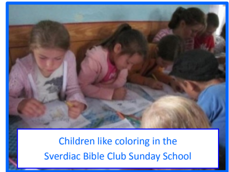
Children like coloring in the Sverdiac Bible Club Sunday School