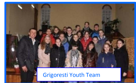
Grigoresti Youth Team