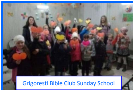
Grigoresti Bible Club Sunday School

Teams of Youth volunteers who participate in their own Youth Bible Clubs also take on leadership roles in the Children's Bible Clubs. They have studied CSI strategy and materials which help them realize the Bible truths for youth and how to get involved in ministry. They enjoy teaching, leading games and activities, singing and leading prayers. The