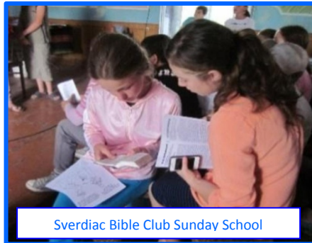
Sverdiac Bible Club Sunday School